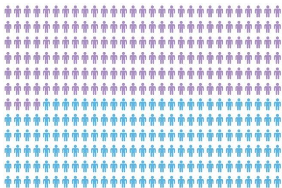
● In-person (287) ● Virtual (273)

93% OF ATTENDEES THOUGHT THAT ATTENDING THE MEETING WAS WORTH THEIR TIME